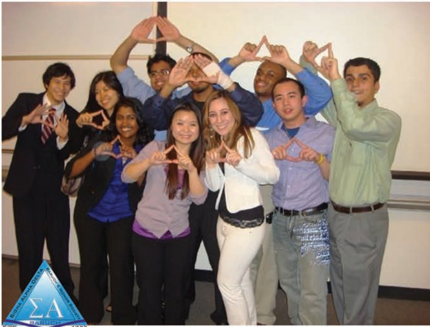
SIGMA ALPHA DELTA FALL 2009